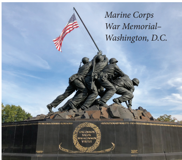
Marine Corps War Memorial—Washington, D.C.

The Nebraskans of World War II Scholarship Fund was created to memorialize the brave men and women who served their country fighting for the freedoms of millions of people.